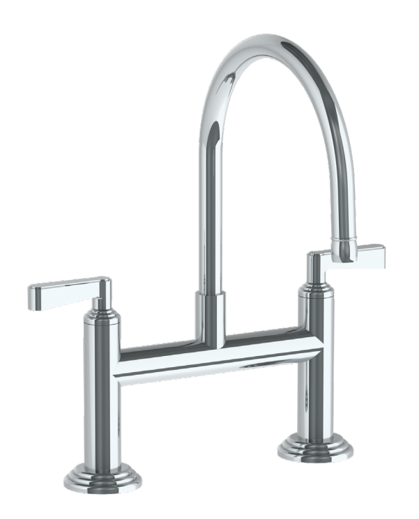
Fits Deck Up To 2" Thick